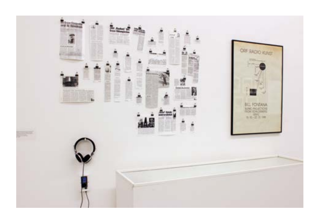
Exhibition view of Beyond Radio: 25 Years of Art Radio—Radio Art, Centre for Artists' Publications at the Weserburg, Bremen, Germany, 2012