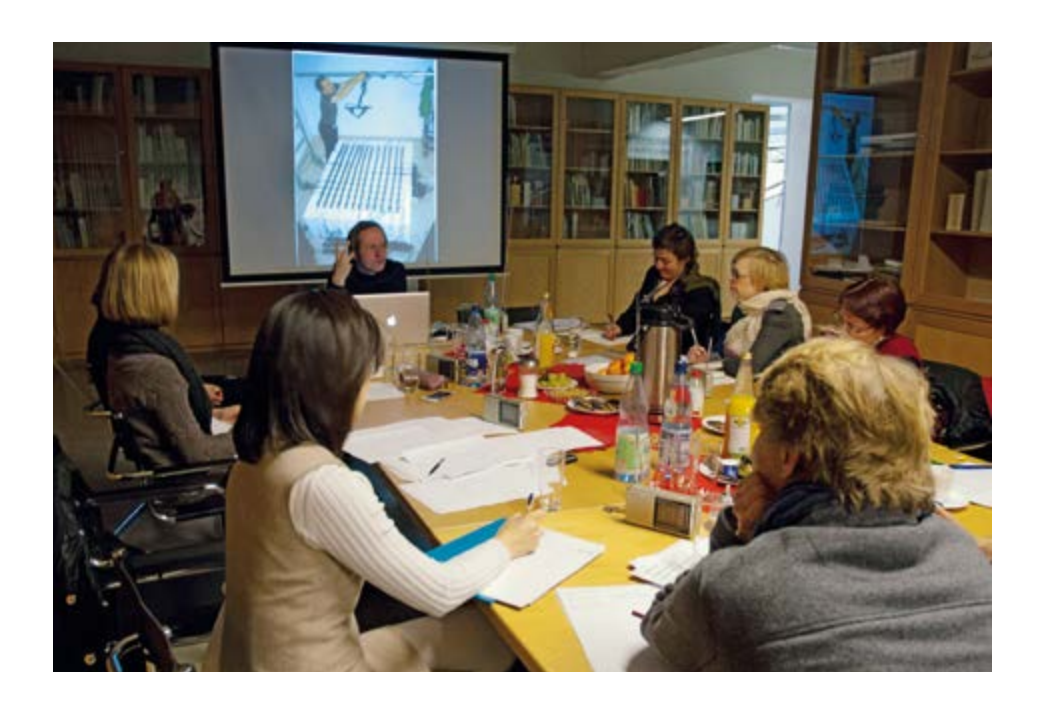
Workshop Mediation of Radio Art: Concepts, Formats and Experiences in the context of the research project Radio Art: On the Development of a Medium between Aesthetics and Sociocultural Reception History, Bremen, Germany, 2012

the museumization of sound art? Related to these questions is the demand for stronger concepts of radio art mediation in general, also reflected in curatorial concepts and new approaches to create broader contexts for the accessibility of radio art.