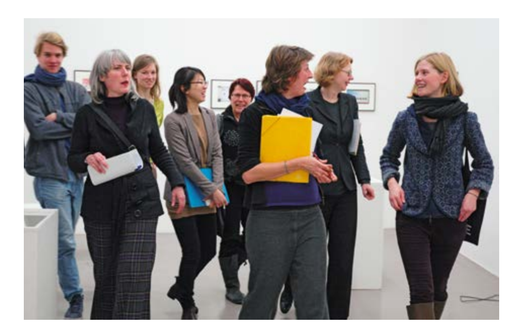
Workshop Mediation of Radio Art: Concepts, Formats and Experiences in the context of the research project Radio Art: On the Development of a Medium between Aesthetics and Sociocultural Reception History, Bremen, Germany, 2012